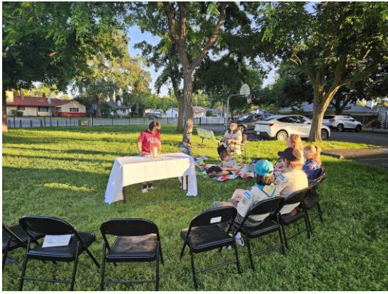
Scouts Read Sacred Texts: we had 7 scouts and 3 adults. Everyone got to read scriptures or prayers.