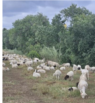
Sunday School visiting the West Sacramento sheep!