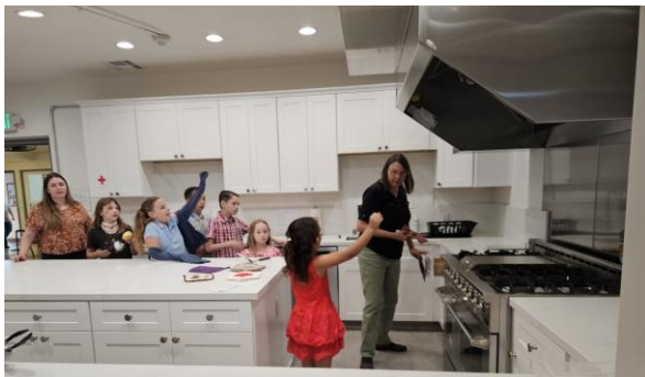
Sunday School made cookies in the kitchen.