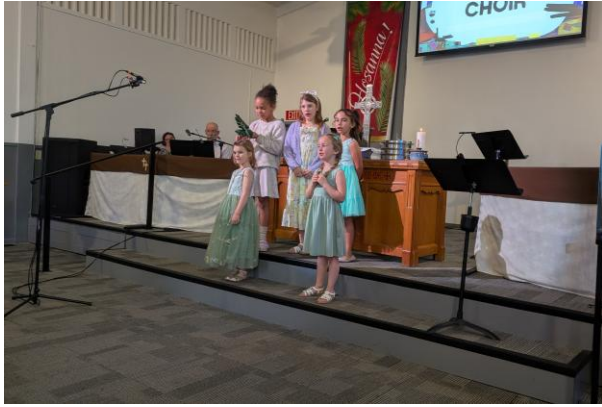
Youth Choir singing on Palm Sunday.