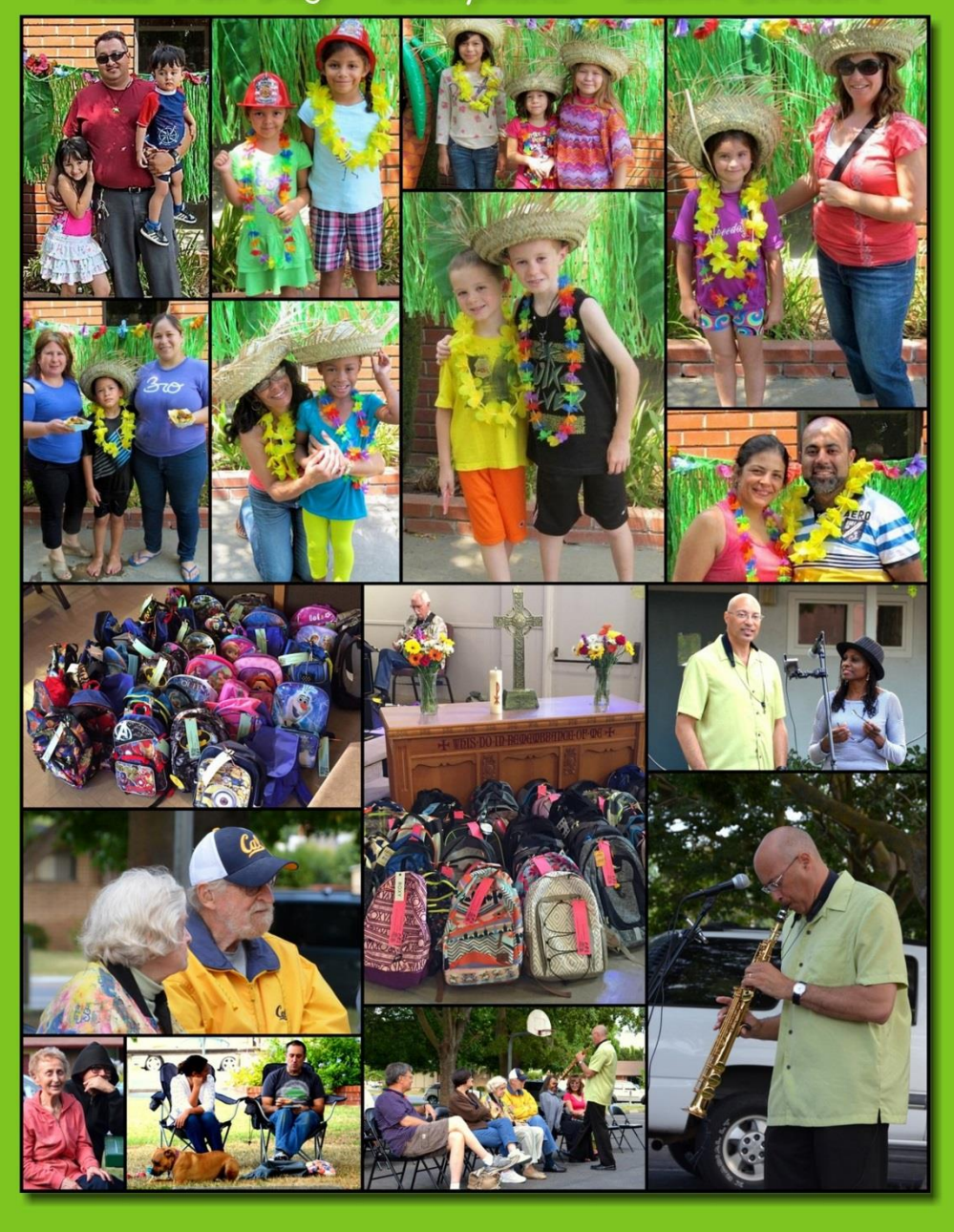
Kids' Fun Day - Backpacks - Lawn Concert