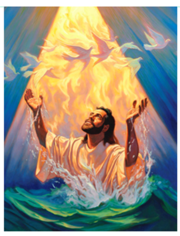
Mark 1: 9-15