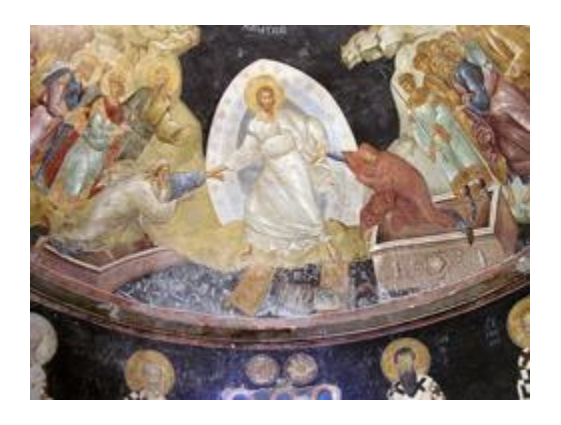
14th century fresco of the Resurrection from Chora Church, Istanbul.

The Easter Vigil is officially the first service of Easter. In fact, Christian feast days generally begin at sunset on the previous day (best known in the example of Christmas Eve). For this reason, the duration of the Easter Triduum ("three days") is from the evening of Maundy Thursday to the evening of Easter Sunday. The same principle applies to the Jewish reckoning of liturgical time, in which the sabbath begins at dusk and continues to nightfall of the following day. This is reflected in the priestly "refrain" of the Genesis 1 creation story: "and there was evening, and there was morning, the nth day."