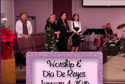
Worship & Dia De Reyes January 4, 2015