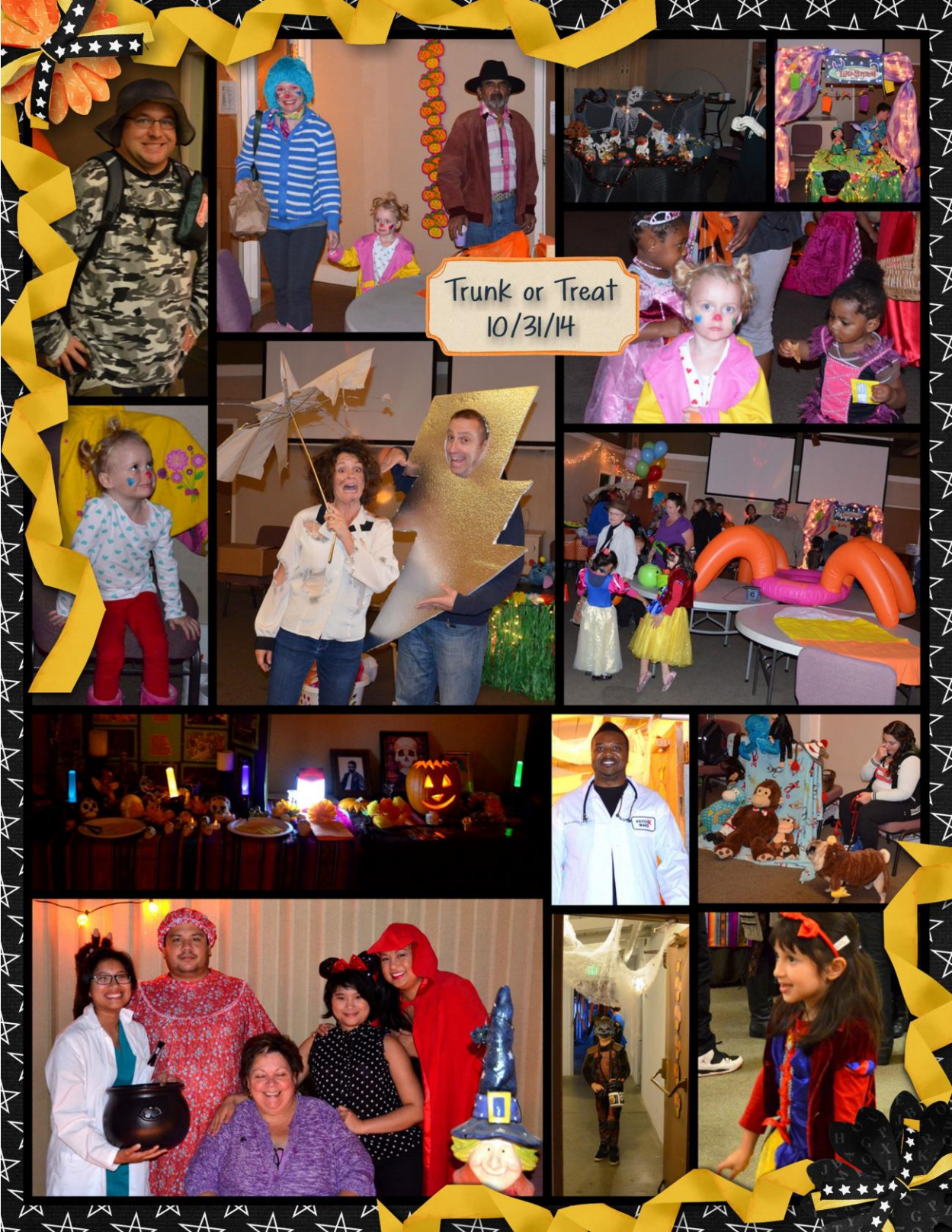
Trunk or Treat 10/31/14